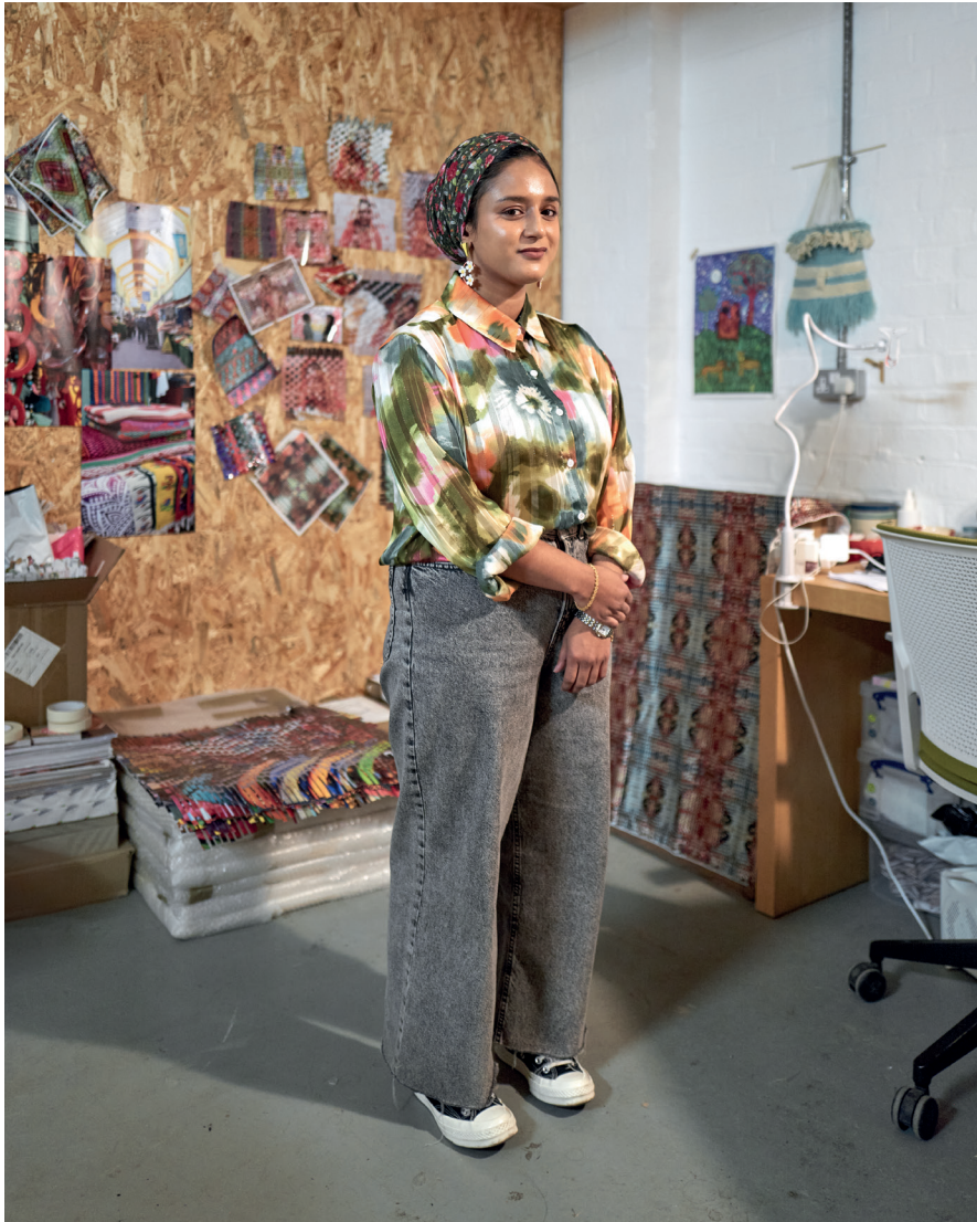
Nilupa Yasmin Studio image