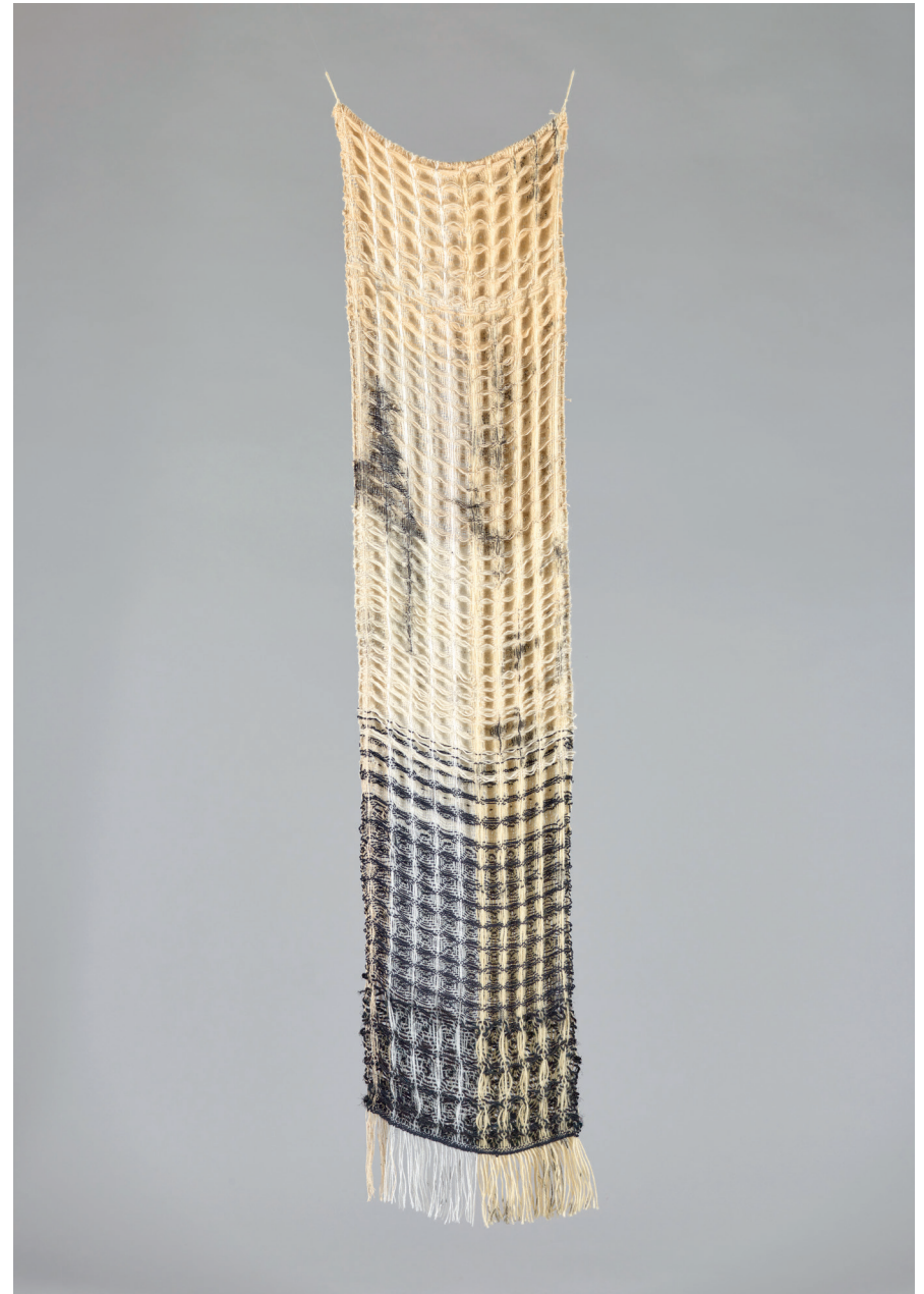
Jade Webb Triptych of sorts, 2024 Wool, hemp, raw silk Leicester

For all these artists the way they make is as important to them as what they make.